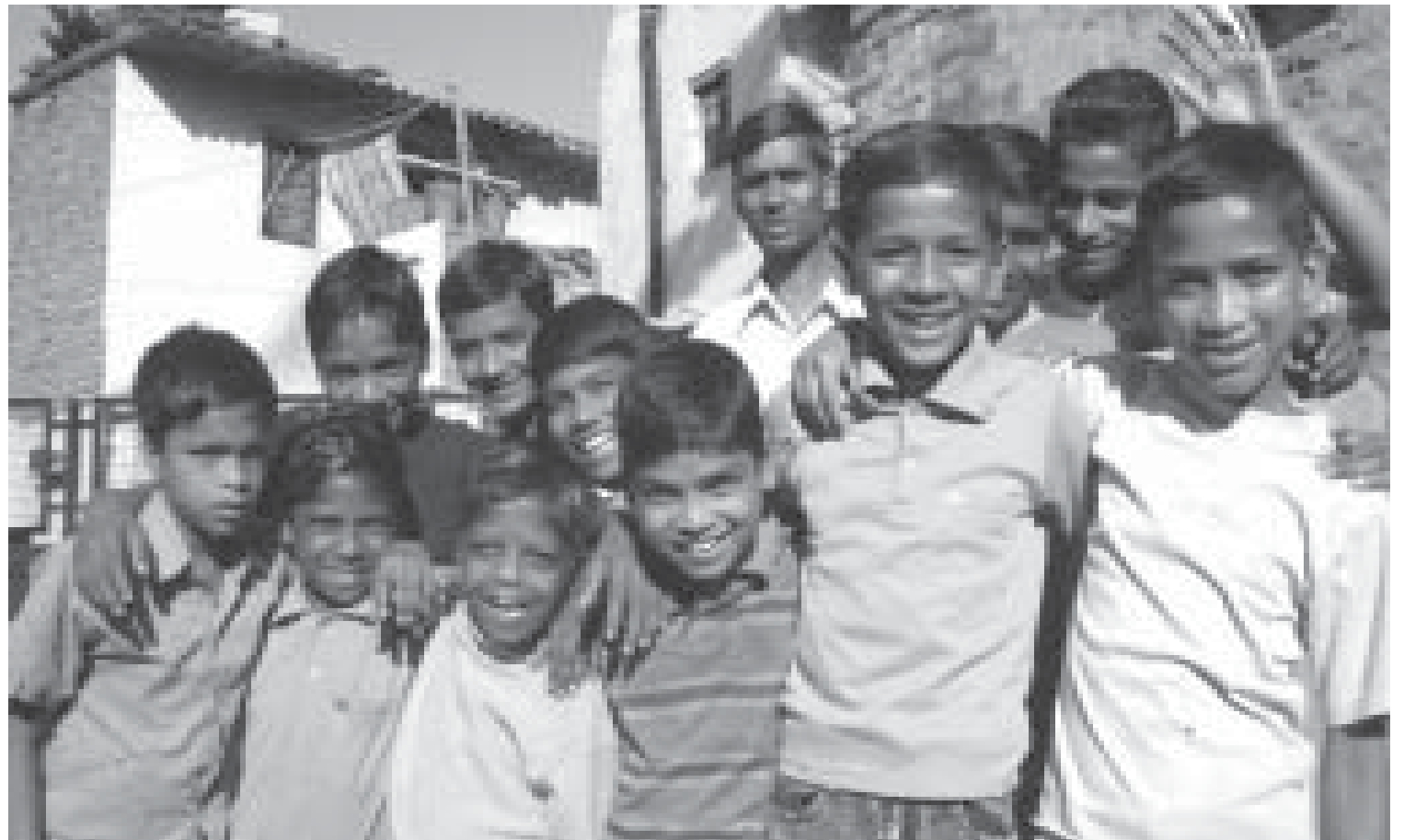
Children of Swagat Kendra - looking ahead to a secure future.

The Swagat Kendra is a shelter home/drop-in centre set-up two years ago to reach out to destitute and exploited children. It is located in the community centre adjacent to the Okhla whole sale vegetable market in South Delhi.