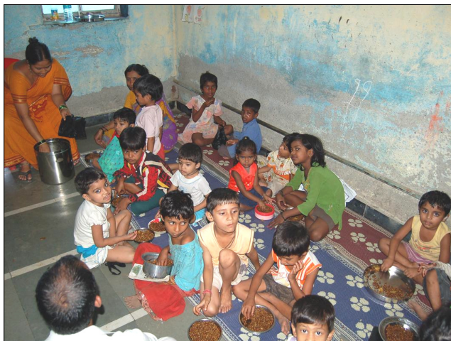
Children in Walmiki Nagar eating the Anganwadi supplied lunch.

Also this month LIFE distributed toys in the communities of Walmiki Nagar and Dnyaneshwar Nagar.