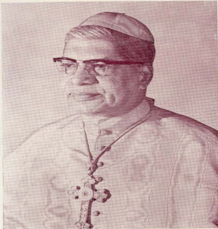
HIS EMINENCE VALERIAN CARDINAL GRACIAS (1900-1978)

In Grateful Memory of his fifty-two years of ministry in the Archdiocese of Bombay as Priest, Bishop and Archbishop