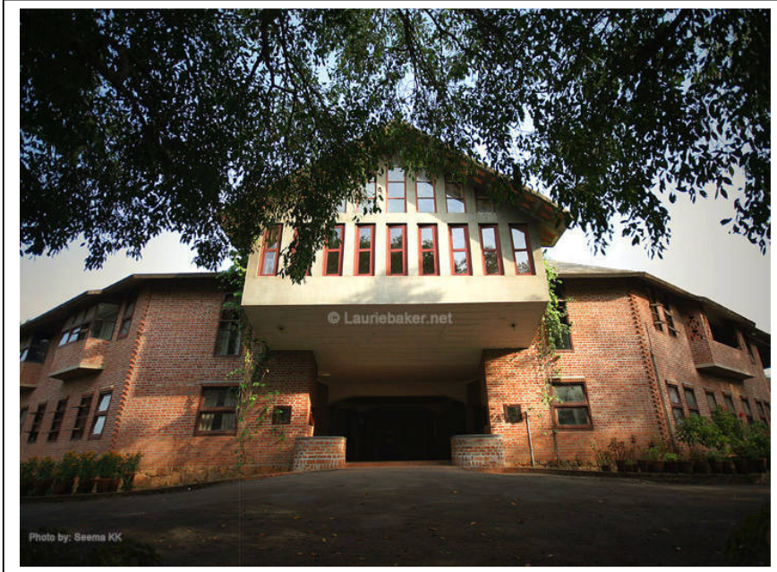
Centre for Development Studies ( Trivandrum ) Laurie Baker Construction Approx Cost : 700 / Sq Ft